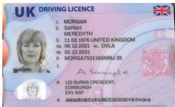
driving license (British)